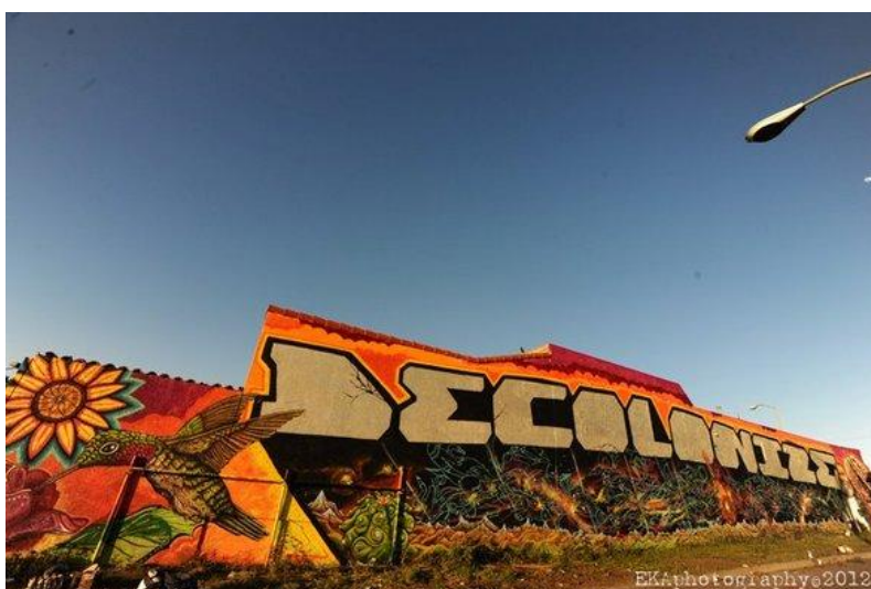
Figure 1 The message of Decolonization meets the people. Photo by Eric Arnold. More Photos at www.CRPBayArea.org

As we enter the third month of the year, the Community Rejuvenation Project has rolled out another monumental mural. Located at the intersection of East 12th St. and 16th Ave. in East Oakland — a highly visible location facing both the BART tracks and the 880 freeway — a massive “Decolonize” message greets thousands of commuters daily. The 30’ x 200’ mural— painted over the course of 2 and ½ days by CRP artists Mike 360, Raven, Release, Beats 737, Desi, Rate, Abacus, Pancho, Yesenia, and Dora—suggests a return to traditional values and ancient wisdom.