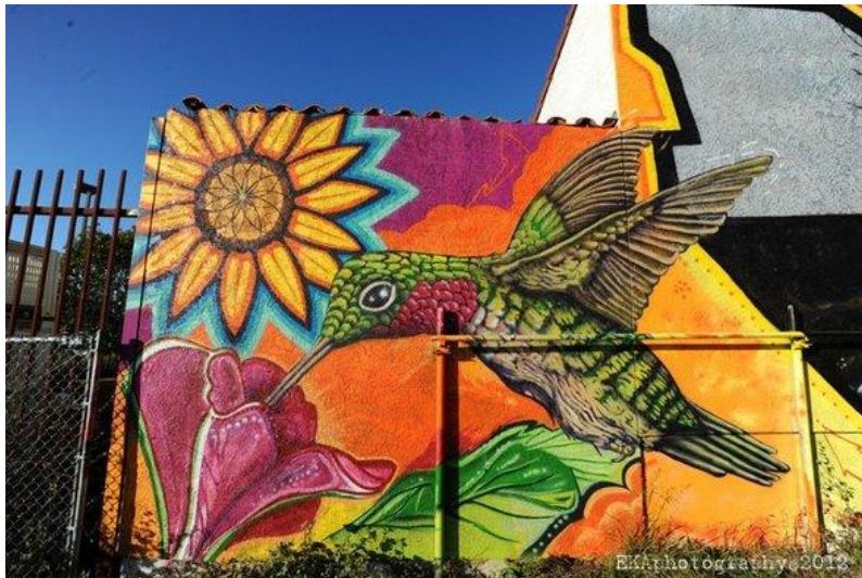
Figure 3 Huitzilopochtli faces the left because he is close to our hearts.

its encampment in Oscar Grant /Frank Ogawa plaza by asking the blessing of local indigenous elders. This was an appropriate first step. Yet since then, however, the indigenous community and communities of color have repeatedly voiced concerns around exclusion, despite the fact that these communities were affected by economic woes, underemployment, and bank foreclosures long before the recession hit the white middle-class. Many in these communities also objected to the name "Occupy" – a term inherently identified with colonialism and the colonial mentality. Yet a proposal to rename the movement "Decolonize Oakland" was voted down by the General Assembly.